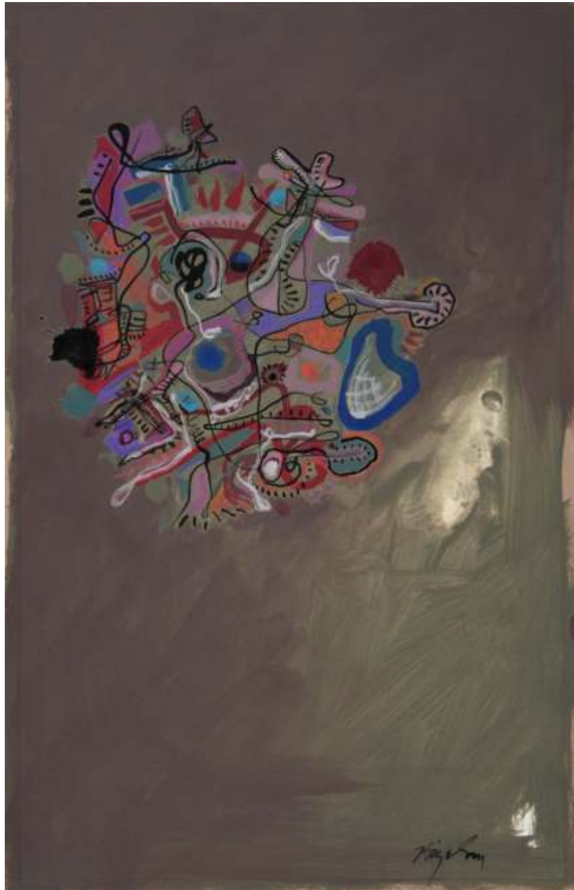
Untitled - 20 x13 inches - acrylic on paper - 2007