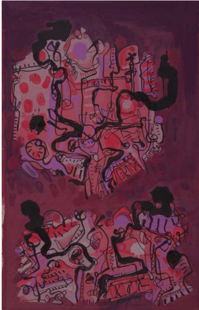
Untitled - 20 x13 inches - acrylic on paper - 2007