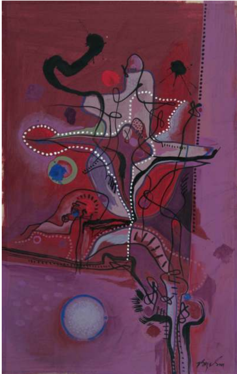
Untitled - 20 x13 inches - acrylic on paper - 2007