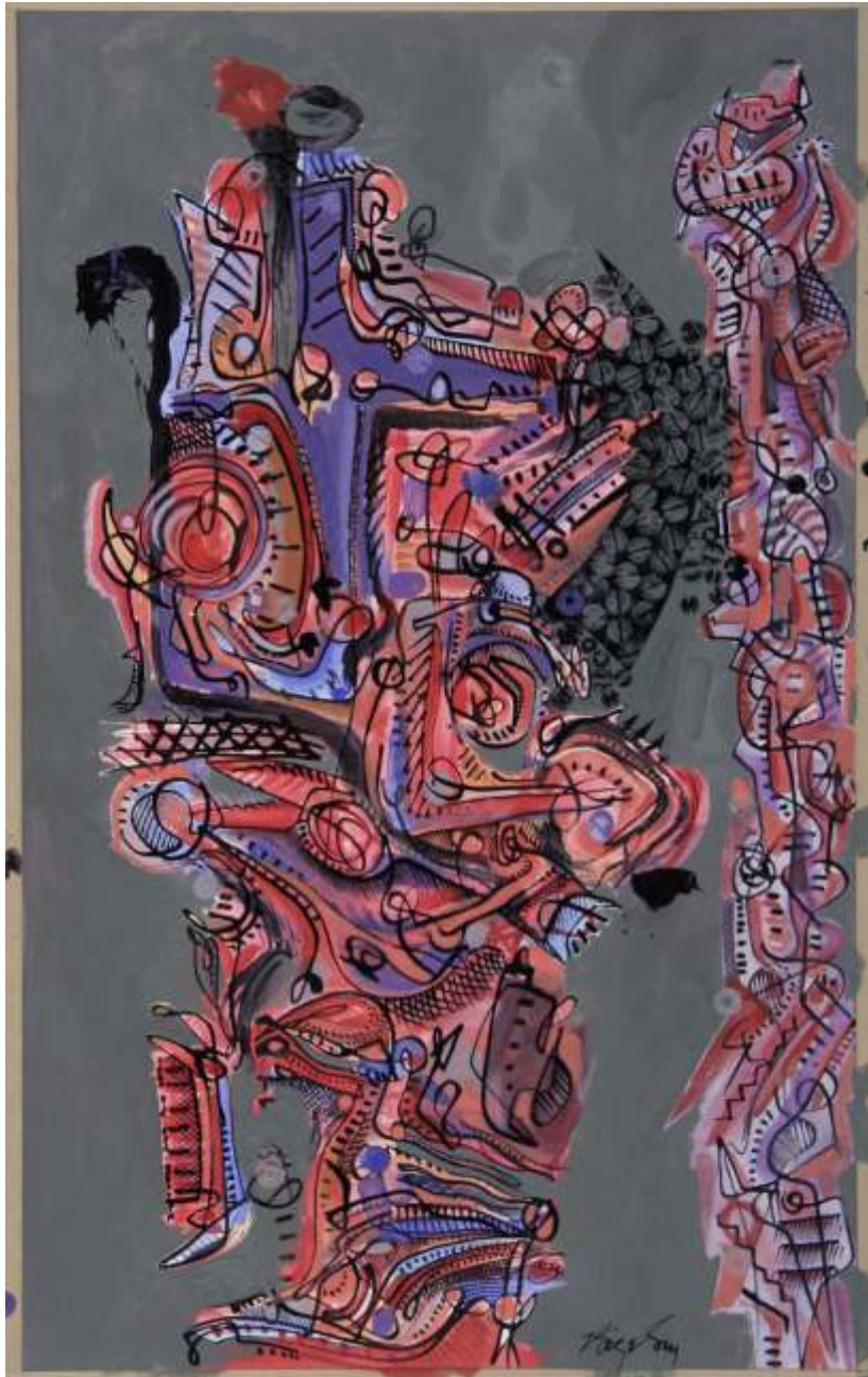
Untitled - 20 x 13 inches - acrylic on paper - 2007