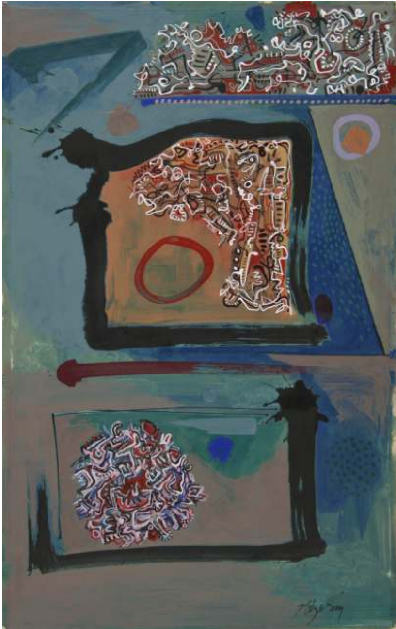
Untitled - 20 x13 inches - acrylic on paper - 2007