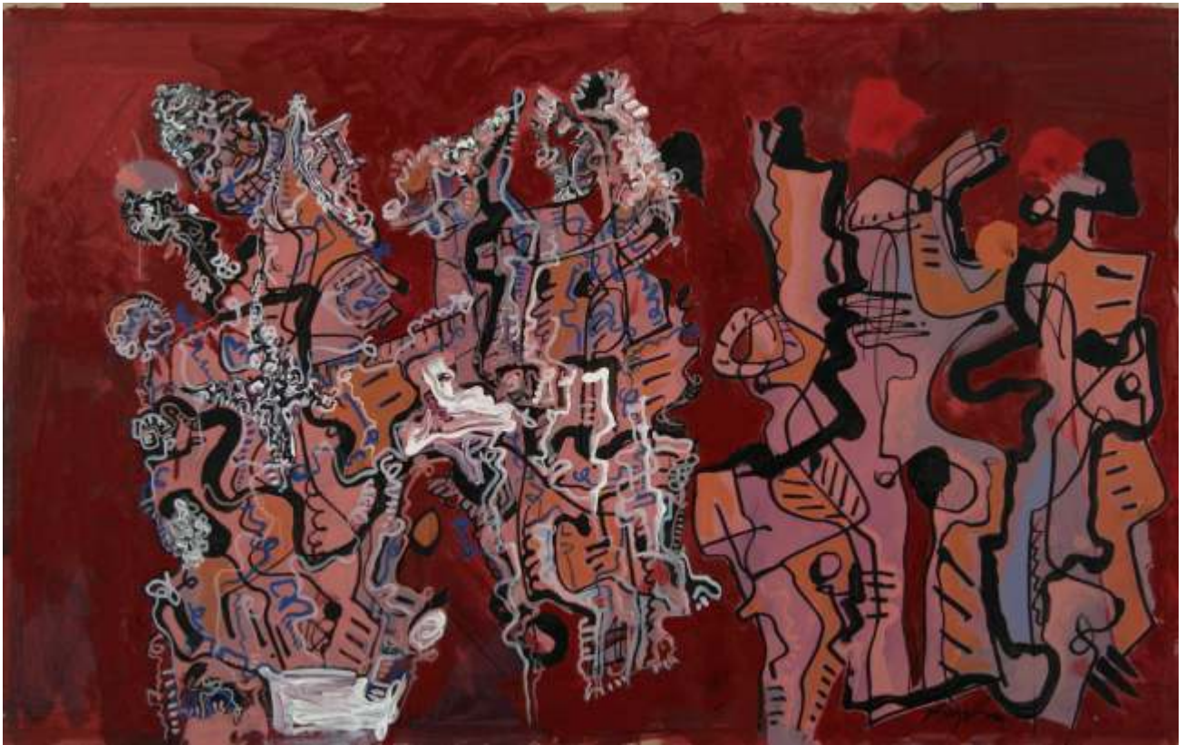
Untitled - 13 x 20 inches - acrylic on paper - 2007