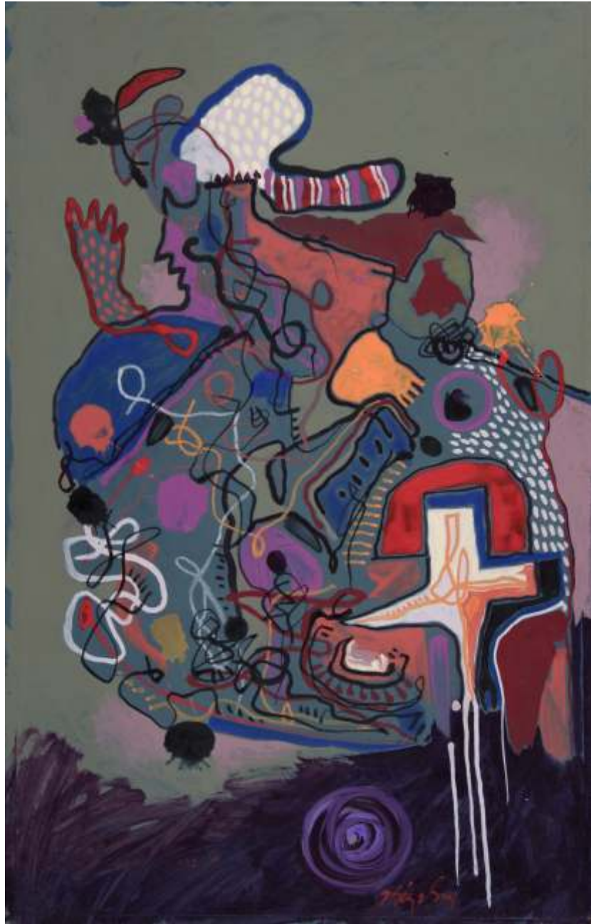
Untitled - 20 x13 inches - acrylic on paper - 2007