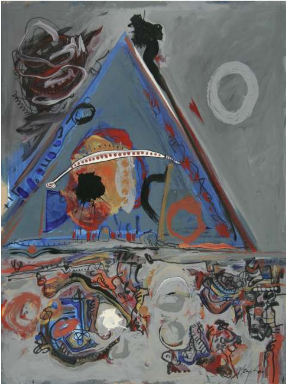
Untitled - 20 x 15 inches - acrylic on paper - 2007