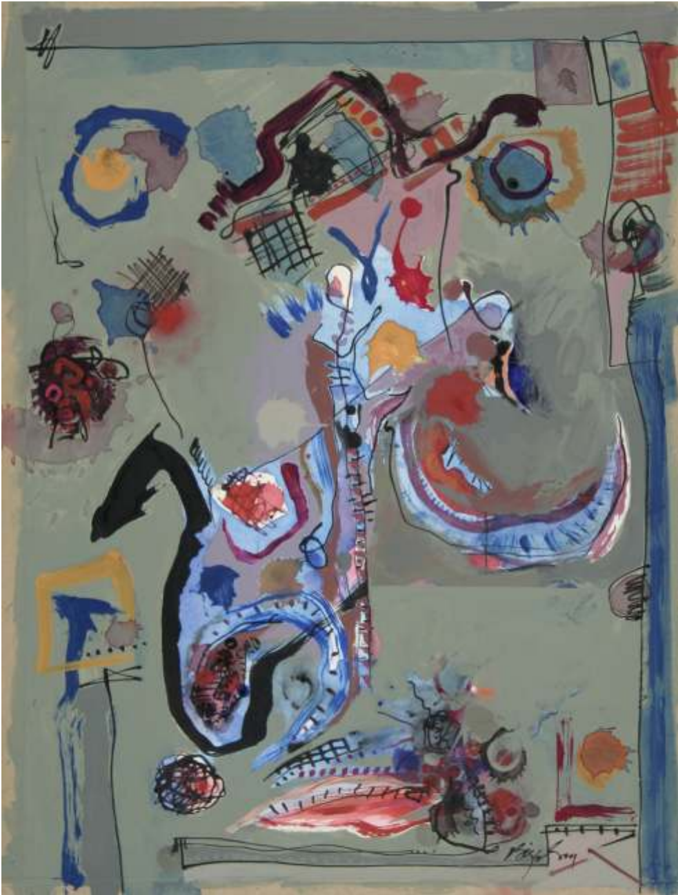
Untitled - 20 x 15 inches - acrylic on paper - 2007