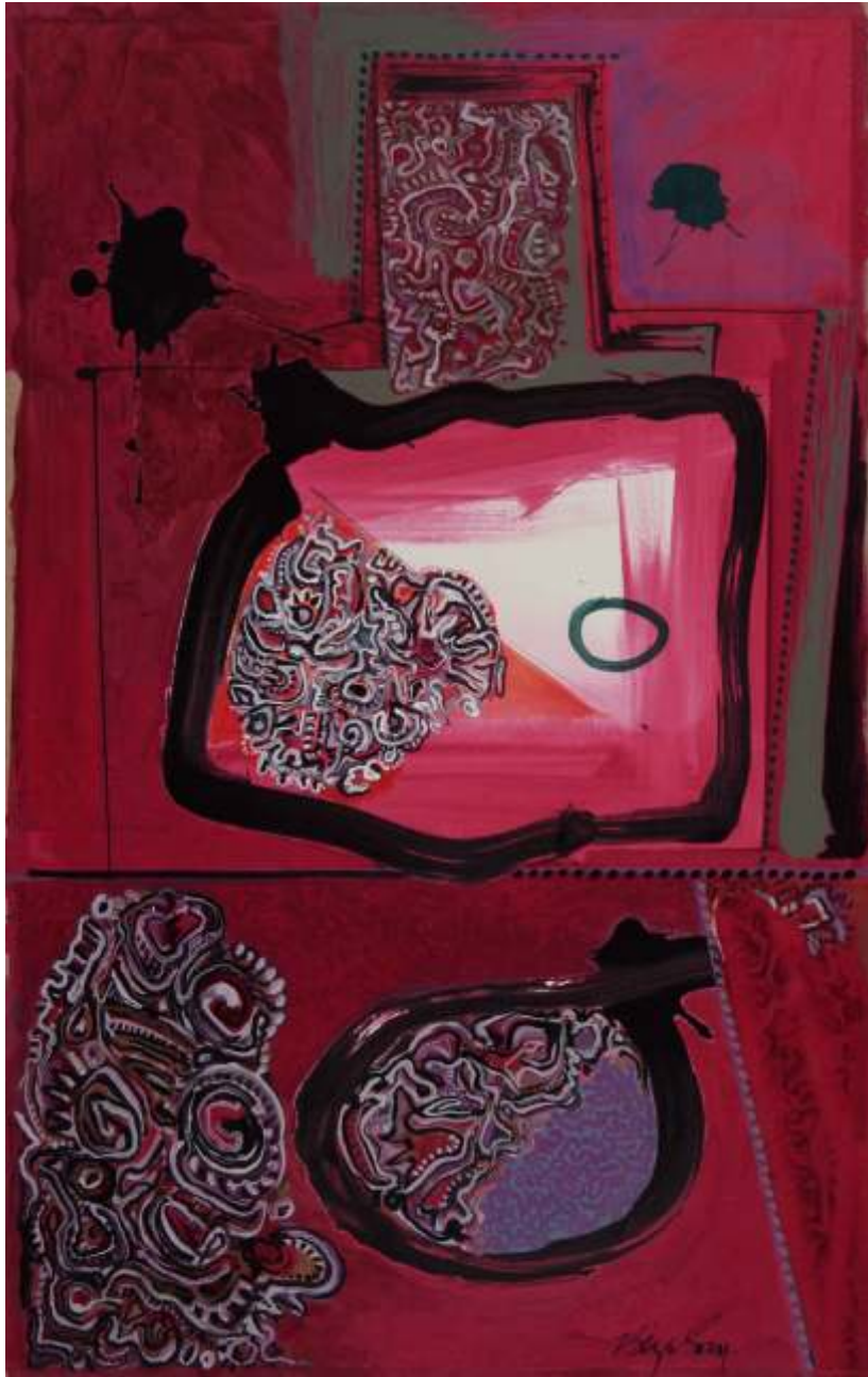
Untitled - 20 x13 inches - acrylic on paper - 2007