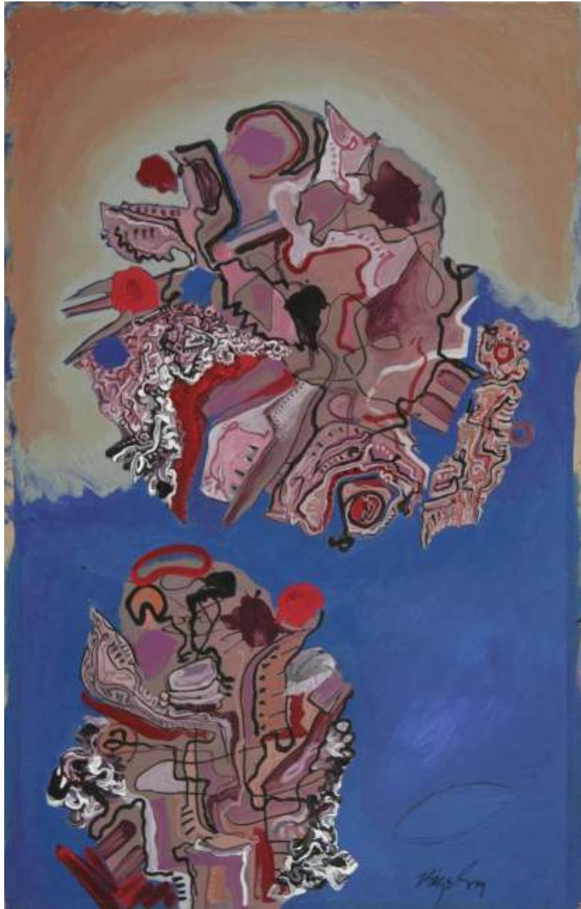
Untitled - 20 x13 inches - acrylic on paper - 2007