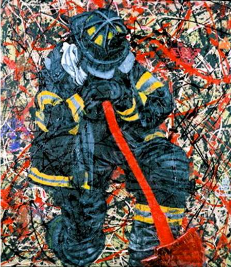
9/11 2003 cel vinyl; acrylic, enamel (SP), pen & ink and oil pastel on linen 122 x 131.1