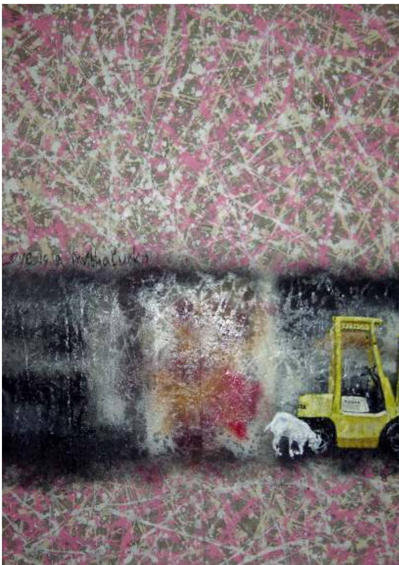
Love is...(a) cel vinyl; acrylic, aerosol (SP) and pen & ink 97.5 x 115.5