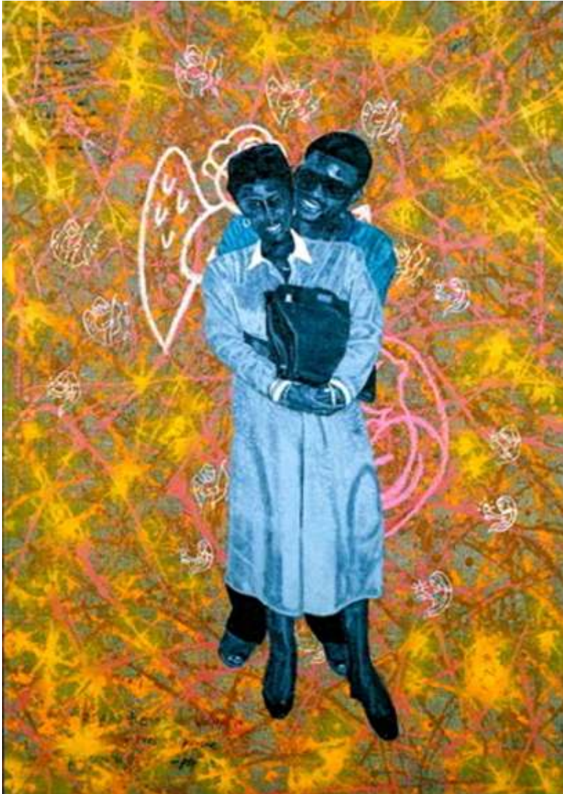
The Lovers 2003 cel vinyl; acrylic, aerosol (SP), pen & ink and oil pastel on linen 90 x139.2