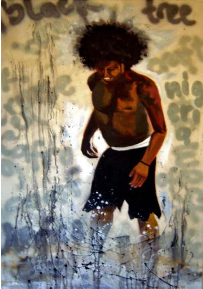
Untitled (i black tree) 2001 acrylic, aerosol (SP), emulsion, Ink and enamel 96 x 157.2