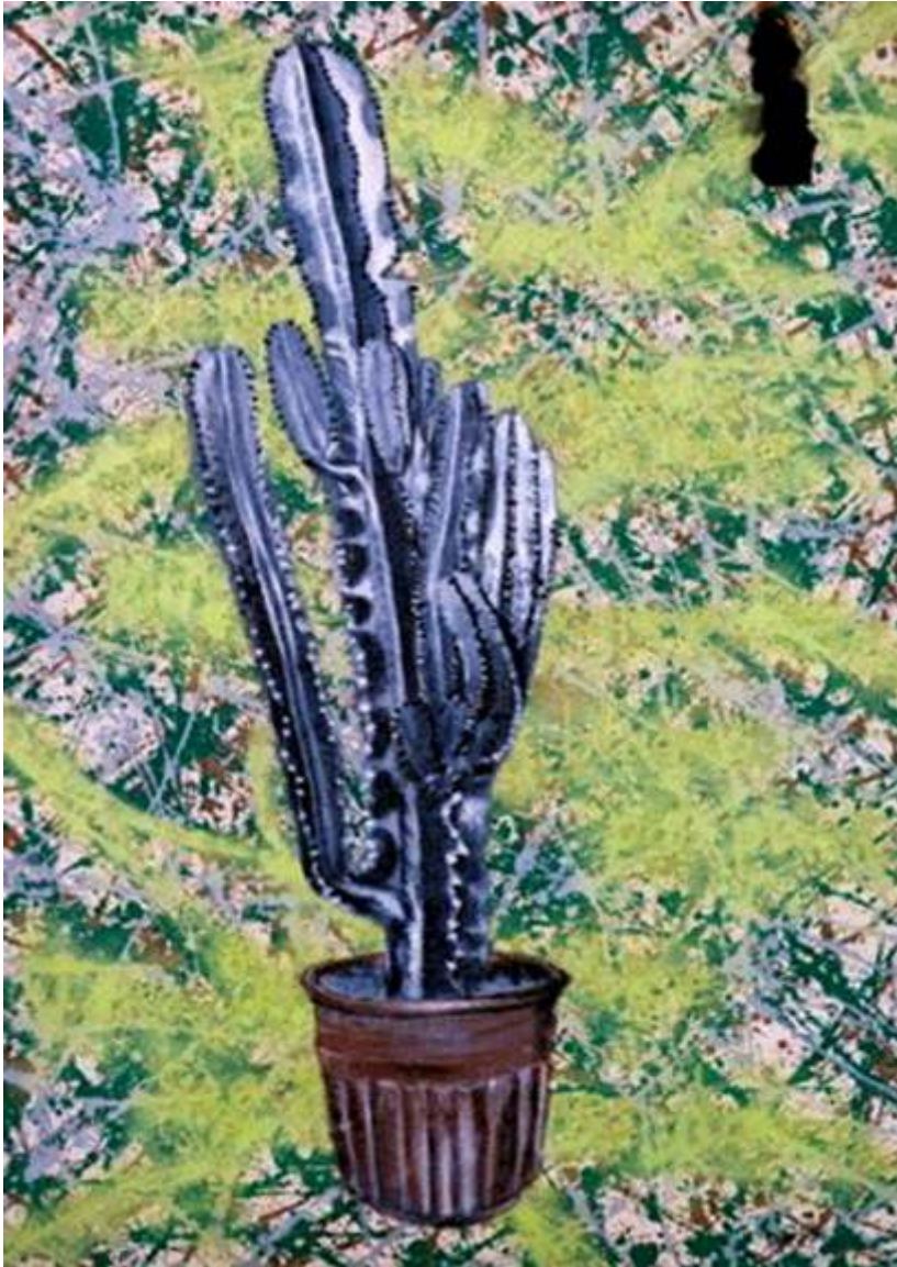
Fast times with cactus Jack 2003 cel vinyl; acrylic, aerosol (SP) and oil pastel & burn 80.2 x 115