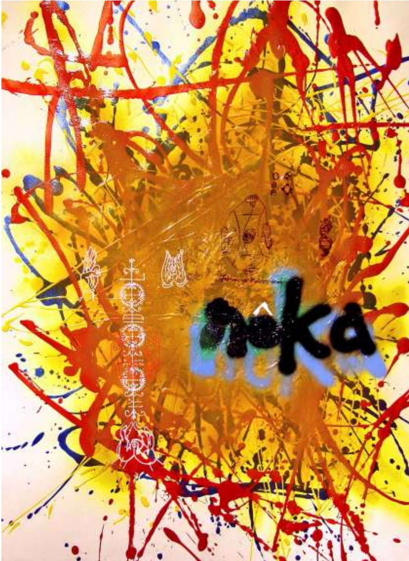
Voodoo High-Ga (The Nôka Paintings 2004) acrylic, aerosol (SP) and pen & ink 56 x 76