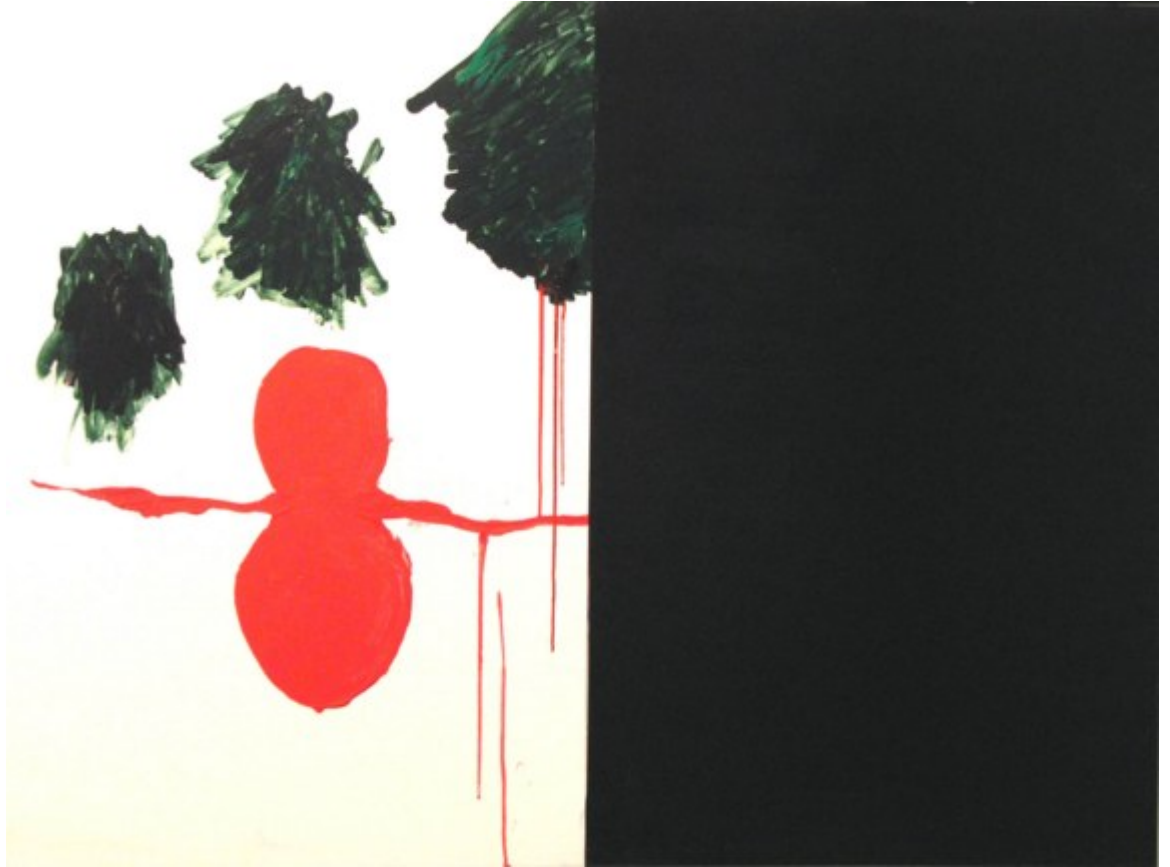
Robert Sussman Untitled # 72305 , 2003 h: 36 x w: 48 in Acrylic on Panels