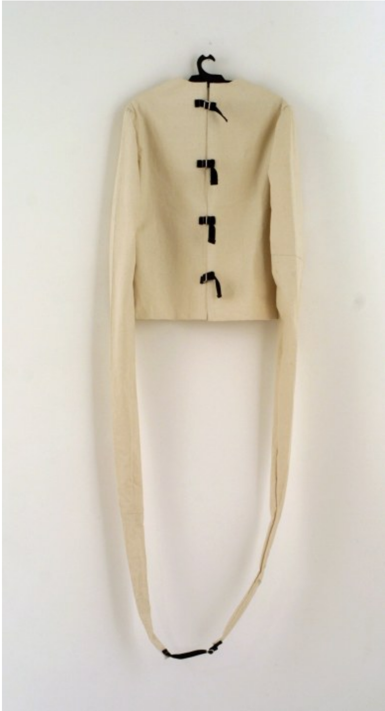
Shim Jeong Eun Strait Jacket , 2002 h: 26 x w: 36 in Canvas loop