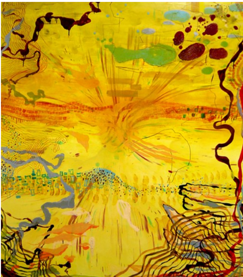
Susan Sharp Internal Logic , 2004 h: 72 x w: 63 in Oil and pen on canvas