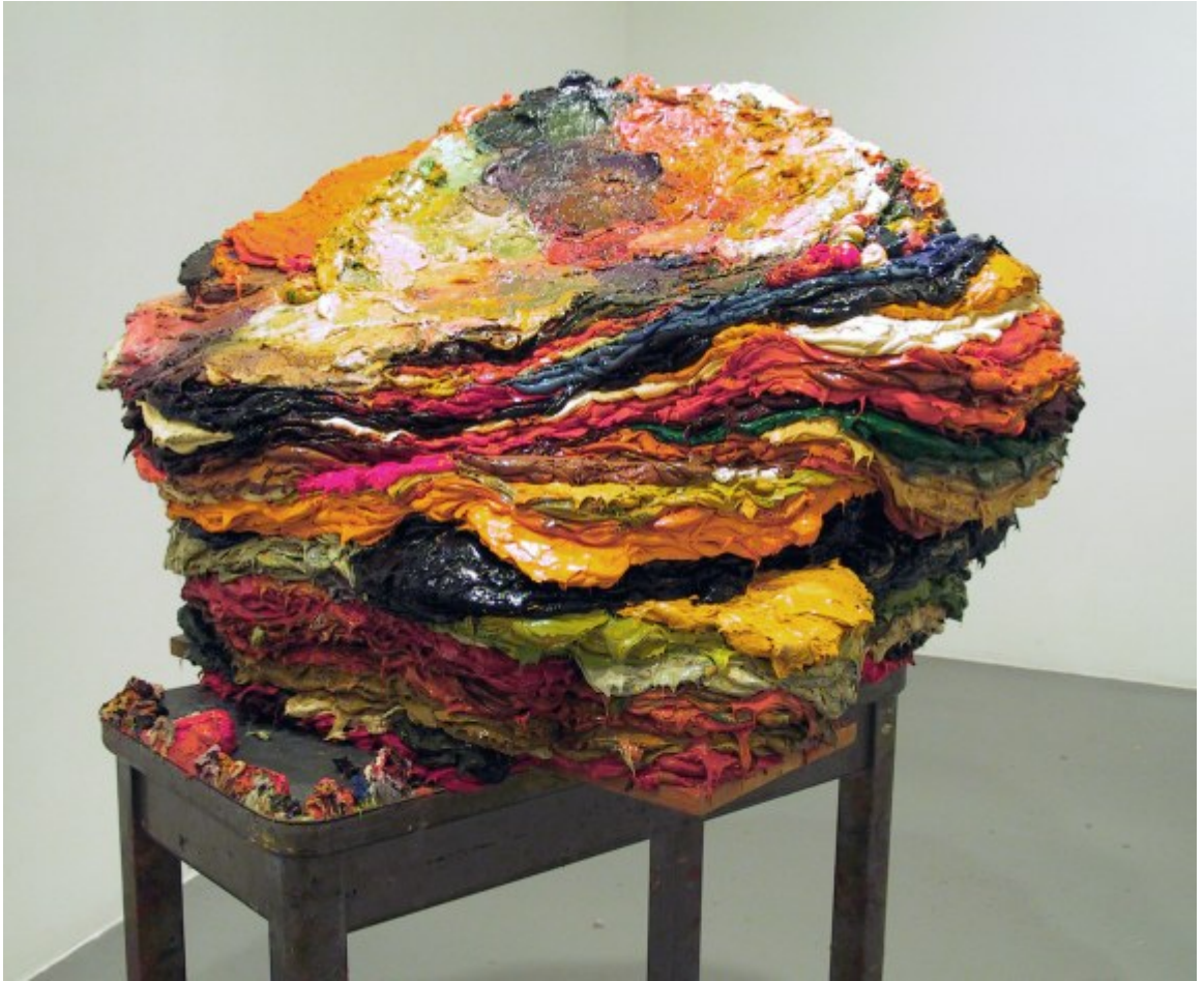
Scott Richter Palette for holding an adequate grudge , 2004 h: 57 x w: 42 x 49 in Oil paint, Medium, Metal palette table