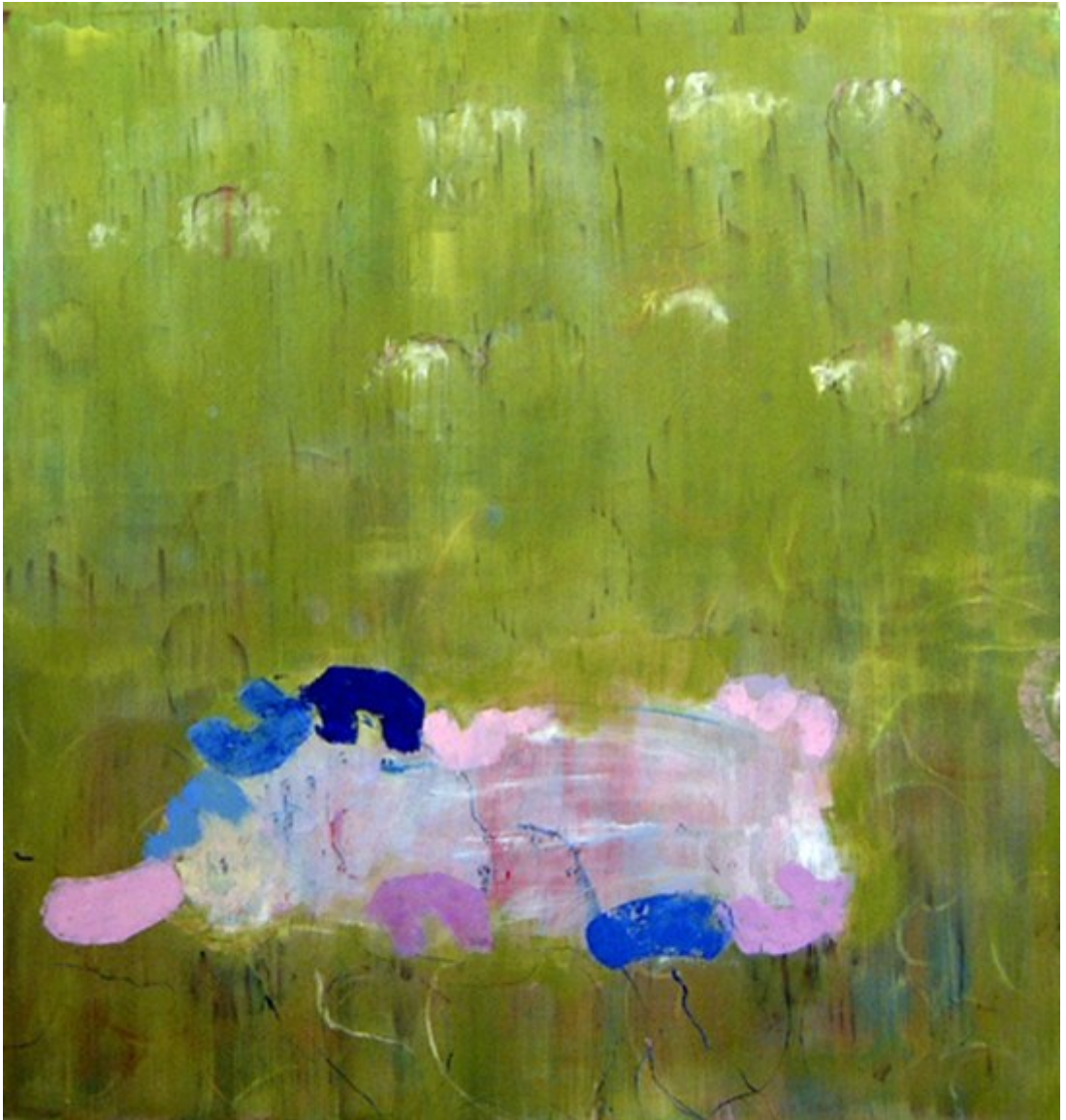
Martin Mullen Fort , 2001 h: 48 x w: 46 in Oil on canvas