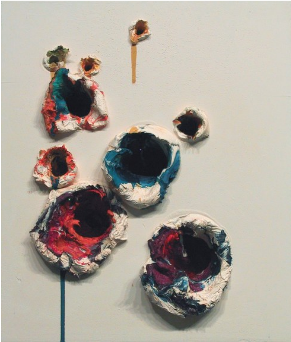
Leslie Wayne Breaking and Entering: Badabang! 2001 h: 14 x w: 12 in Oil on wood