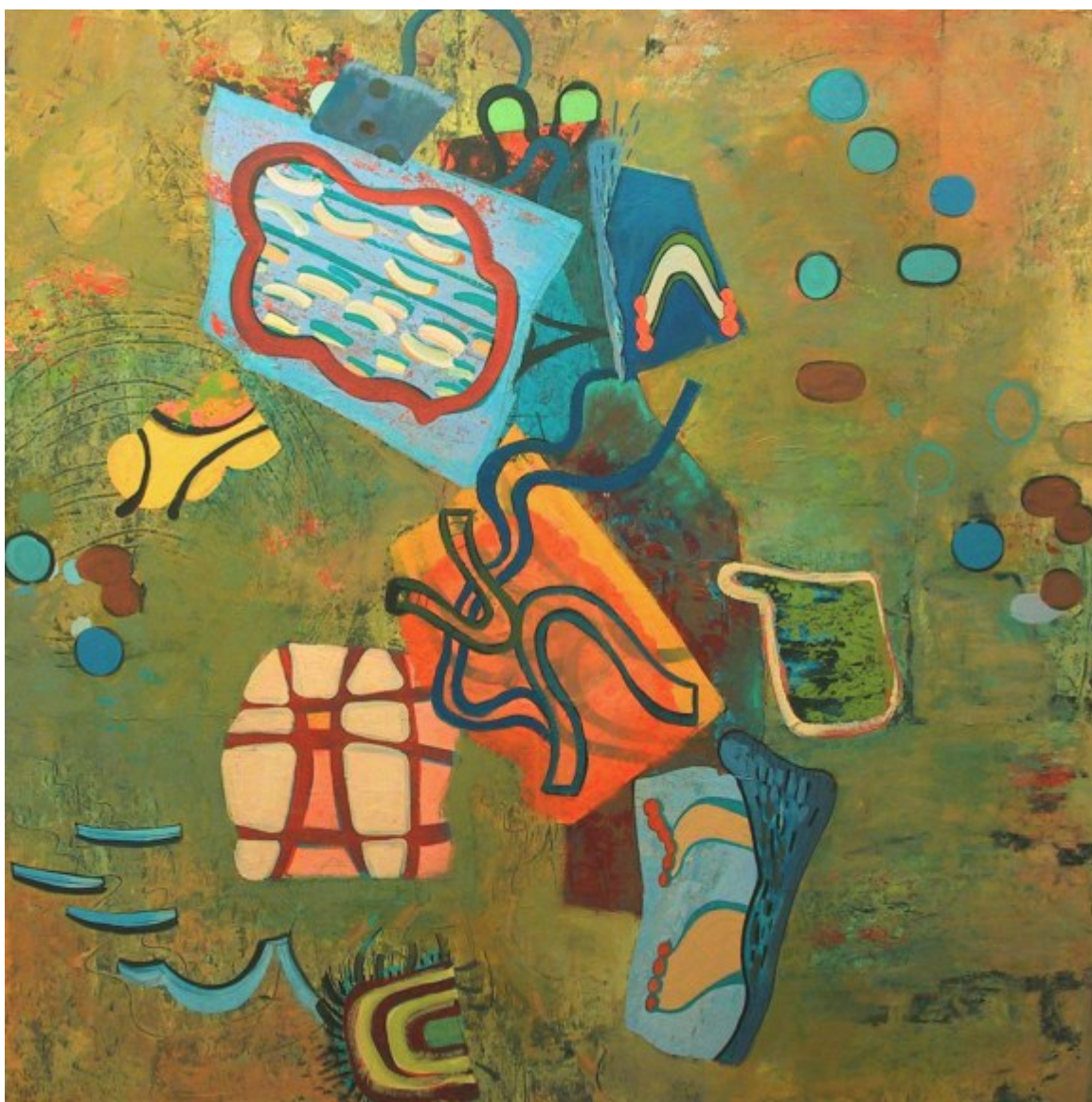
Sandra Perlow Pieces Bulge , 2004 h: 58 x w: 58 in Mixed Media on Canvas