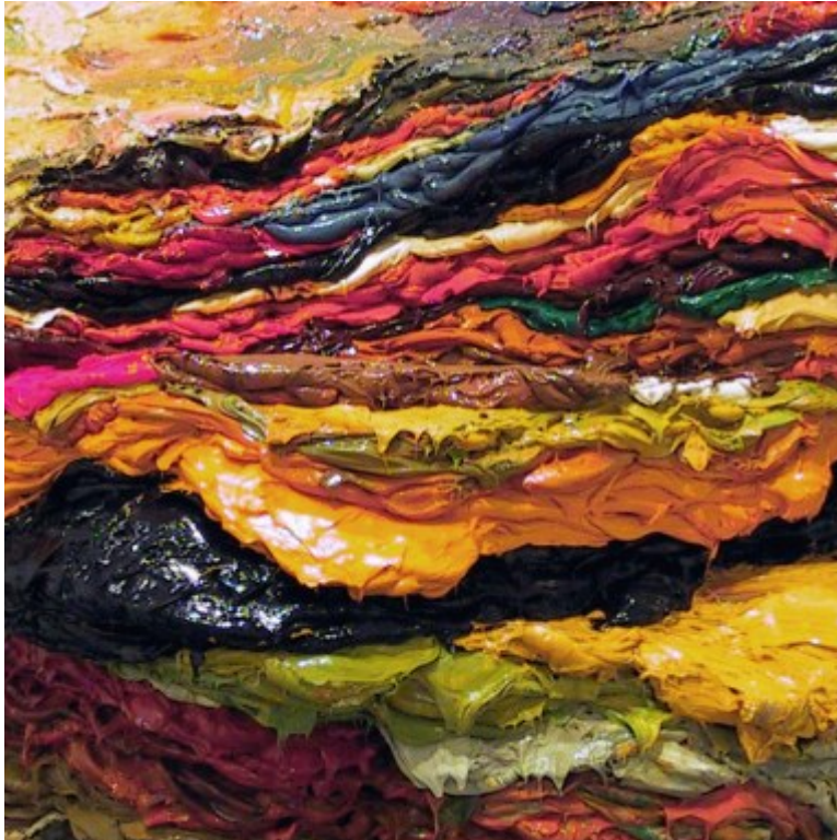
'A Coat Of '